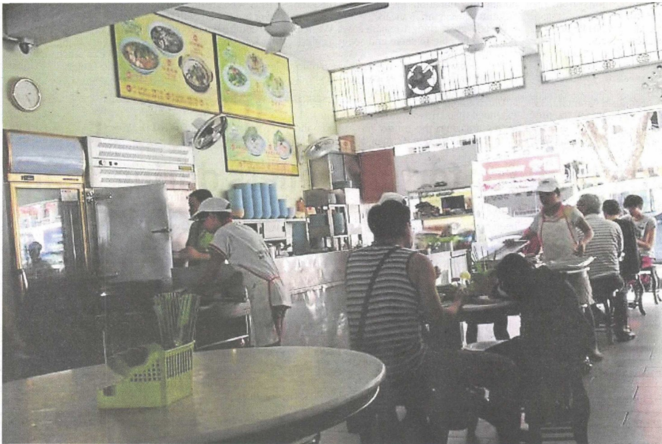
Braving the heat: Patrons eating in a restaurant in Kota Kinabalu which was operating without electricity.