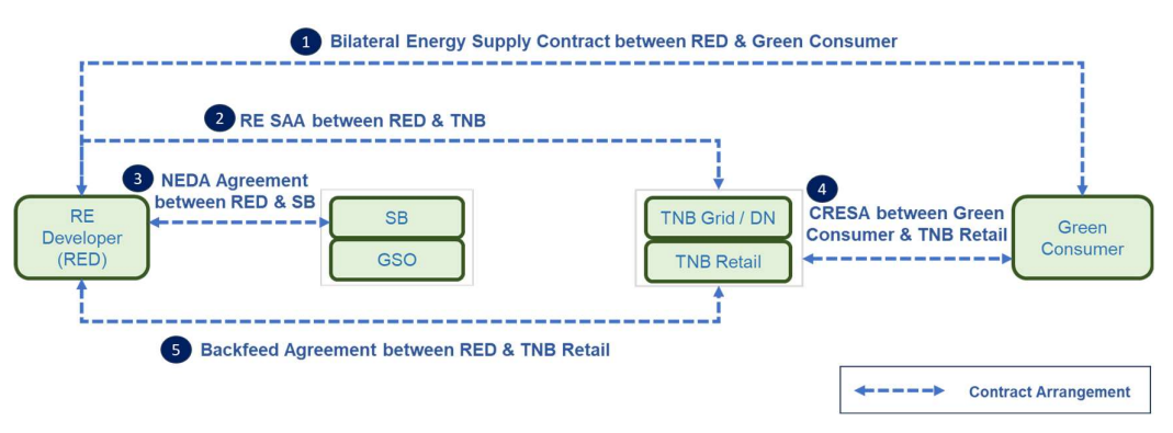
Figure 2: Contractual Framework for CRESS

7.1 The overview of the contractual framework for this CRESS is as illustrated in Figure 2 .