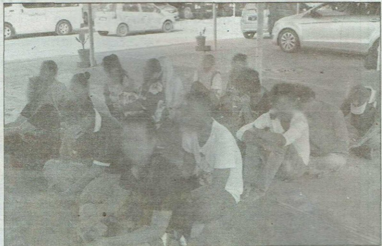
Some of the 39 who detained for further questioning and documentation