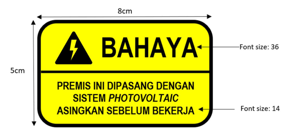
Figure 2: Sample of label