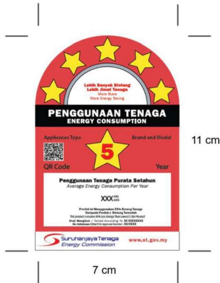
Figure 6 : Label size specification for Electric Oven