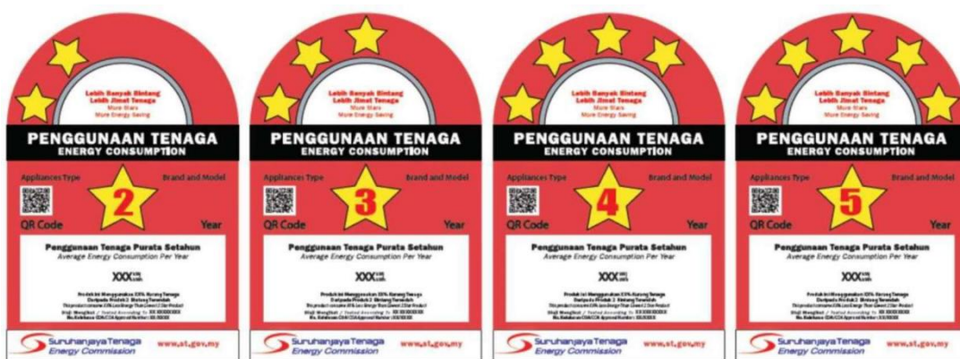
Figure 8 : Label design for 2-star to 5-star

THE REMAINDER OF THIS PAGE HAS BEEN LEFT BLANK INTENTIONALLY