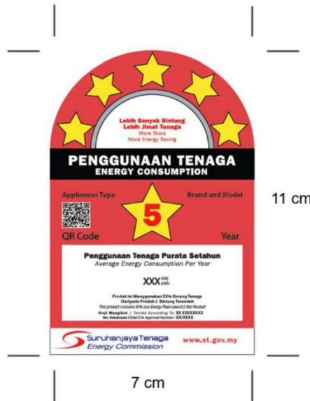
Figure 6 : Label size specification for Electric Oven