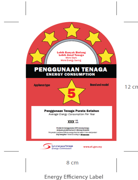
Figure 5 : Label size specification for washing machine, refrigerator, air conditioner, freezer, and television