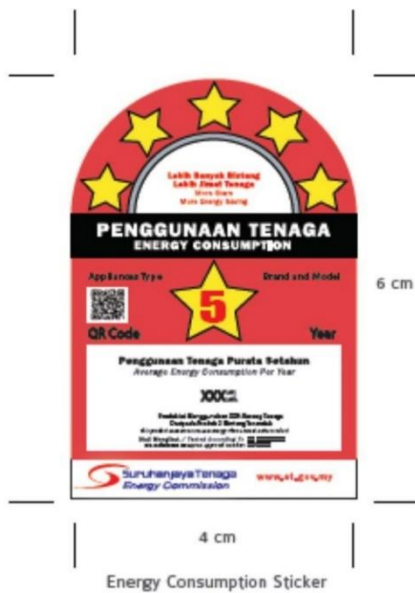
Figure 4 : Label size for rice cooker, microwave and fan

The size of the energy efficiency label is as per Figure 2 and Figure 3.