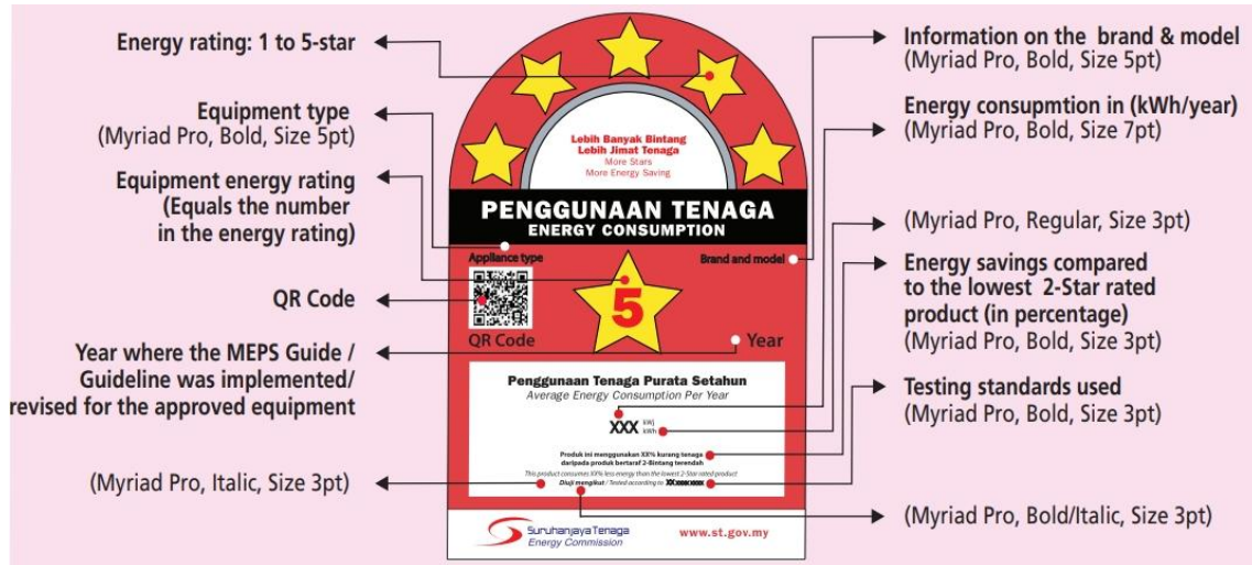
Figure 3 : Energy Efficiency Label

In accordance with the Energy Efficiency and Conservation Act, any equipment that meets all the requirements of efficient use of electricity shall be affixed with an efficiency rating label. It shall be the responsibility of the manufacturer or importer to affix such label. Information to be included in the label is as per Figure 3 .