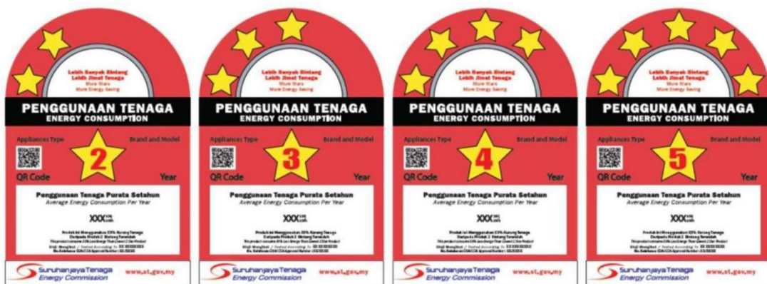
Figure 8 : Label design for 2-star to 5-star

THE REMAINDER OF THIS PAGE HAS BEEN LEFT BLANK INTENTIONALLY