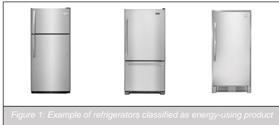
Figure 1: Example of refrigerators classified as energy-using product

2.1.2 The following products are excluded as energy-using product: