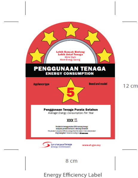
Figure 5 : Label size specification for washing machine, refrigerator, air conditioner, freezer, and television