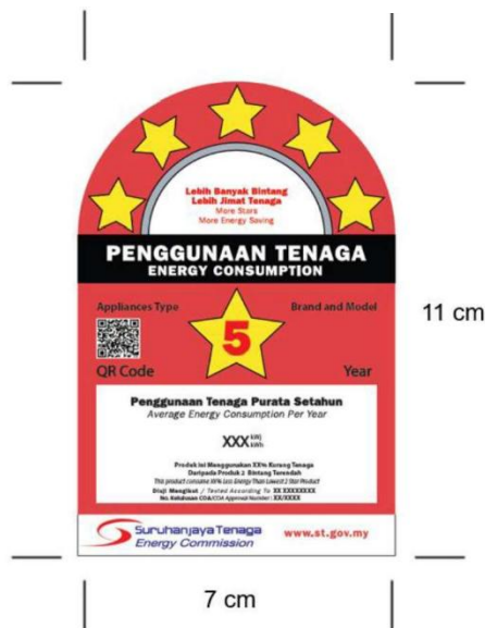
Figure 6 : Label size specification for Electric Oven